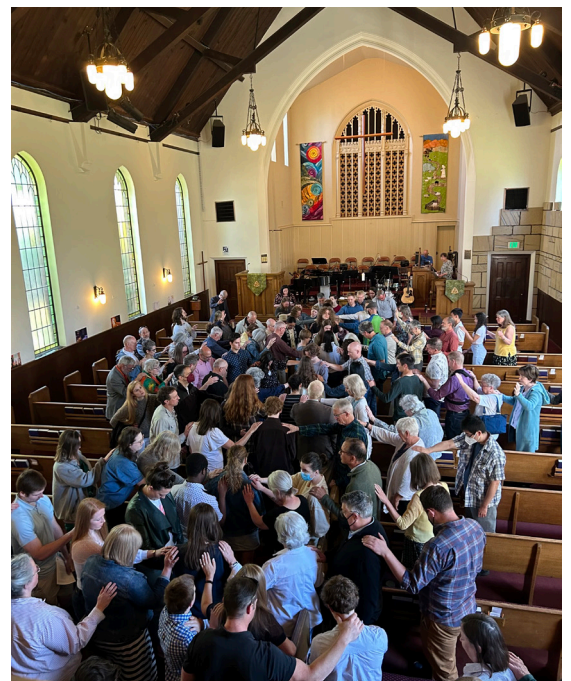
Praying over our graduates in worship on Grad Sunday 6/4

There is a vibrant group of student leaders in the middle school ministry right now. Many will go off to college in the fall. In the weeks leading up to the end of our Thursday night group, they were sharing their faith journeys with our middle school students. This is discipleship for everyone involved! And, as one reflected to me recently: "The middle schoolers seemed to actually listen to me!" As some have shared snippets with me in advance, I am reminded of how vital the whole church has been in equipping them for their life of faith. Which brings me to Graduate Sunday! During both services on June 4th, we celebrated and prayed over our graduating seniors, and wrote affirmation cards to take with them as a reminder that their church family loves them and is cheering them on as they enter this next season. >>> continued on next page >>>